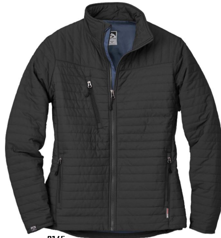
3165- MTO Black

Protect yourself against cold, damp days without sacrificing comfort. Eco-made insulation between water-resistant, windproof fabric yields an amazingly lightweight jacket.