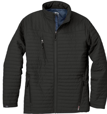
3160- MTO Black

Where you lead, our Eco-Insulated Quilted Jacket will follow. Water-resistant, windproof fabric paired with eco-made insulation gives you comfort and warmth, without bulk to slow you down. Cold, damp days have met their match!