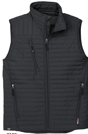
3125- MTO Black

Give yourself some extra insulation without bulking up or getting waterlogged. Eco-friendly, water-resistant, windproof and soft, it's the right choice when the weather's all over the map.