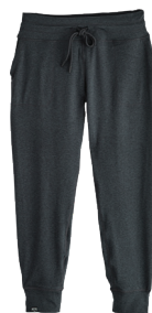
Dark Heather Gray | C