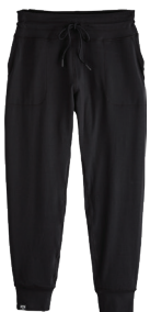
Black | C