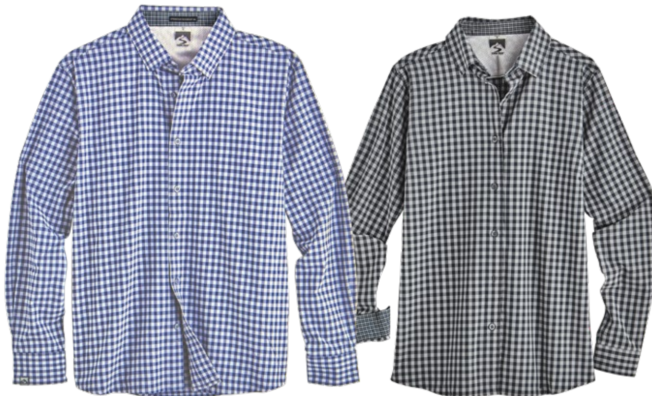
2570 True Blue