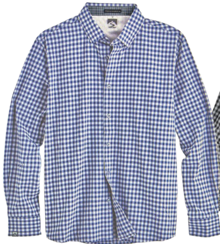
2570 True Blue