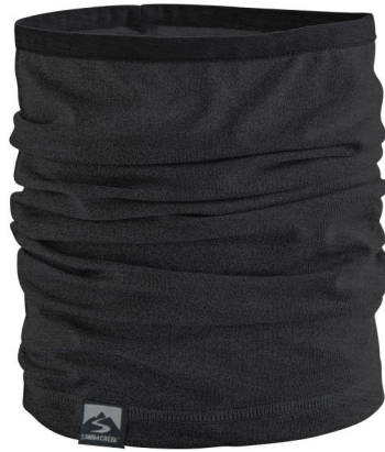
1920 Dark Heather

Protection perfection. This 2-layer sueded jersey neck gaiter keeps the elements at bay. Non-medical use only. Non-returnable.