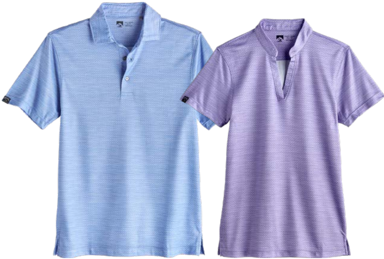
1880 Peri Blue