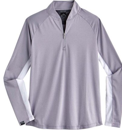
1835 Light Heather Gray