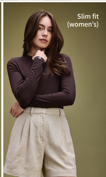
Slim fit (women's)