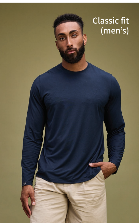
Classic fit (men's)